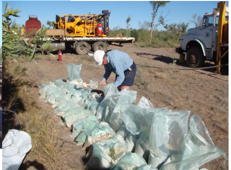
Inspecting percussion precollar samples