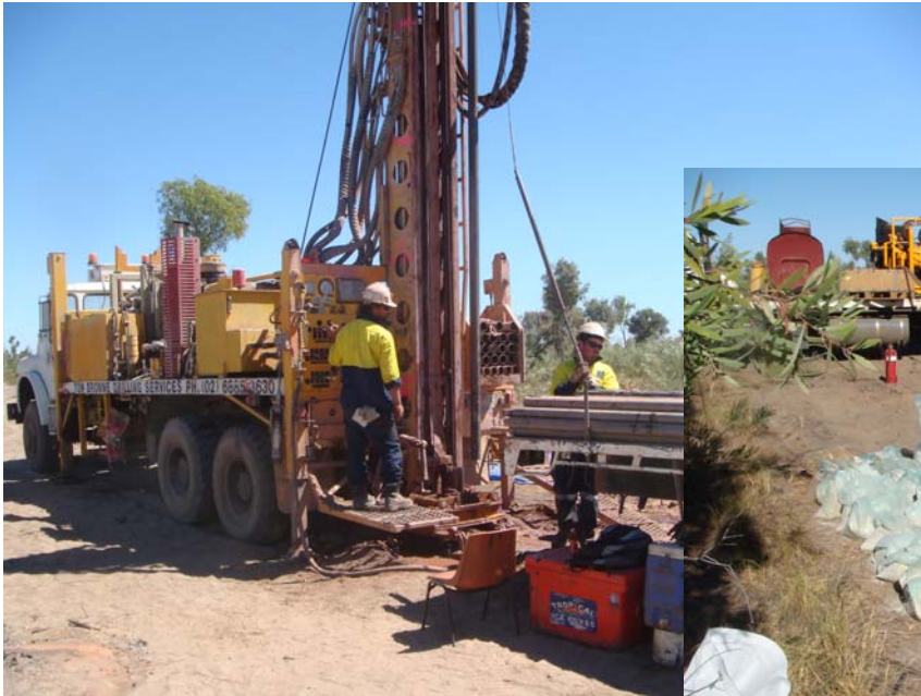
Diamond core drilling at Calvert Hills