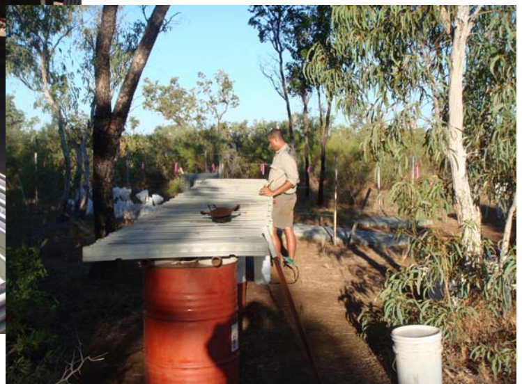
Geological logging of drill core