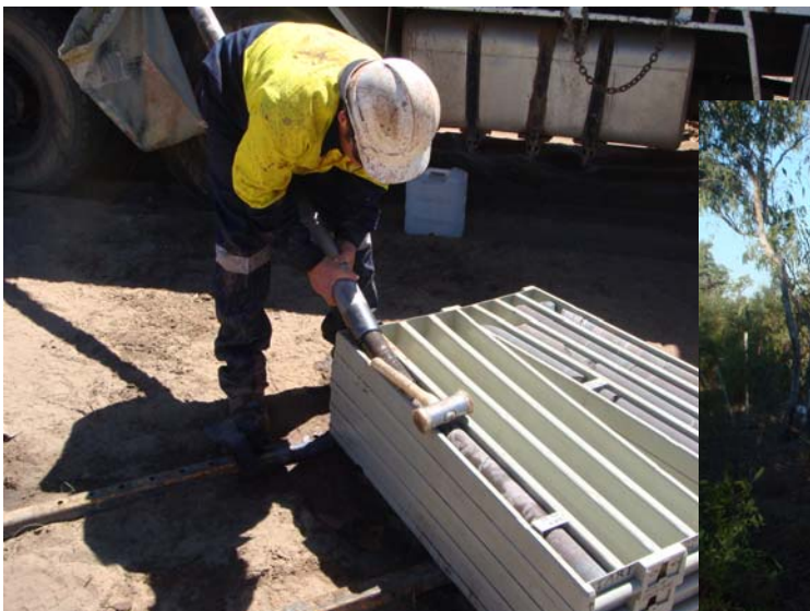
Retrieving core samples from the drill string